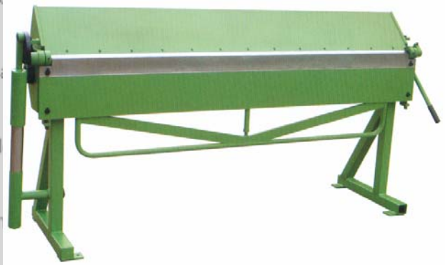
W1.0 x 2020