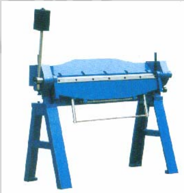
W2.0 x 1000