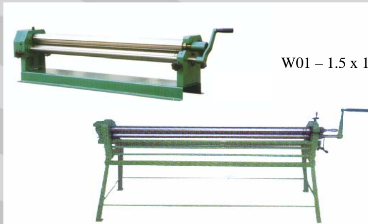
W01 – 1.5 x 1300