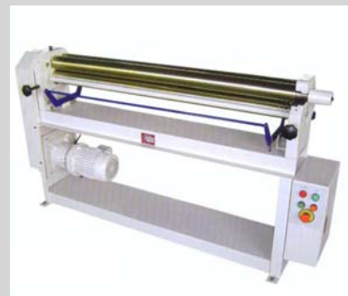
ESR – 1300 x 1.5